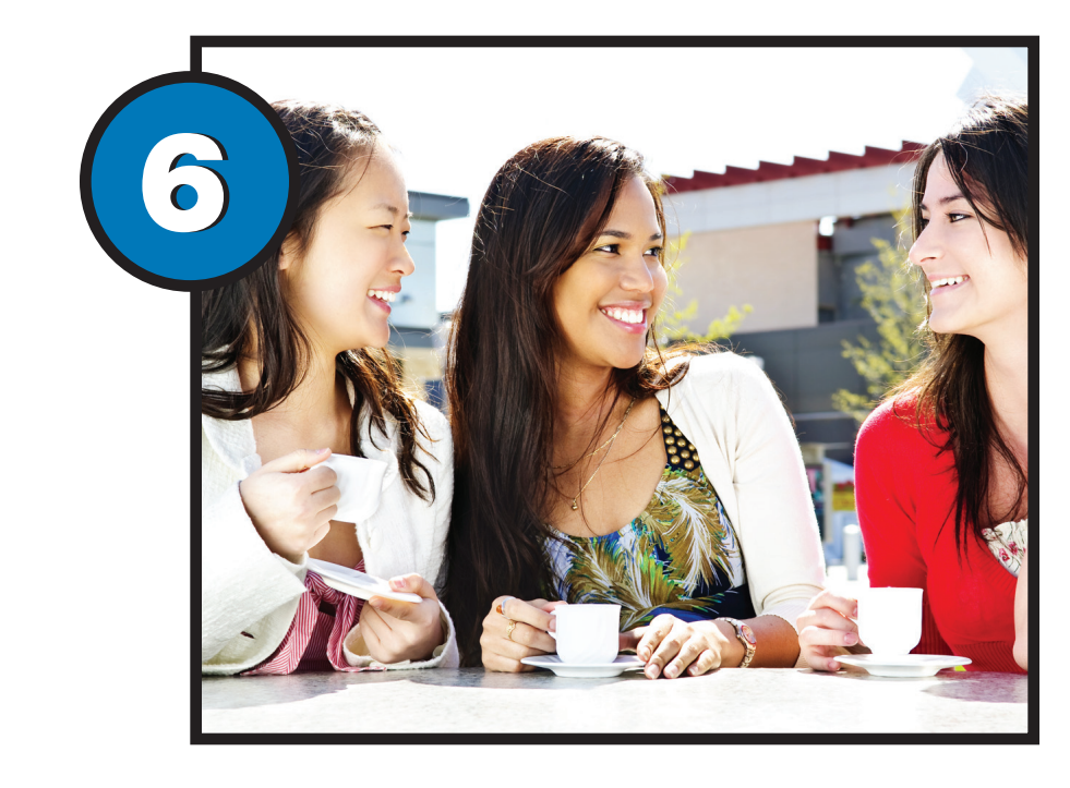
Continue to look for open positions.