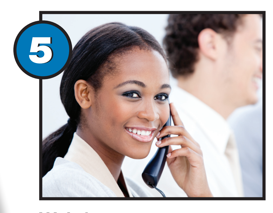
Wait for contact or follow up with the employer