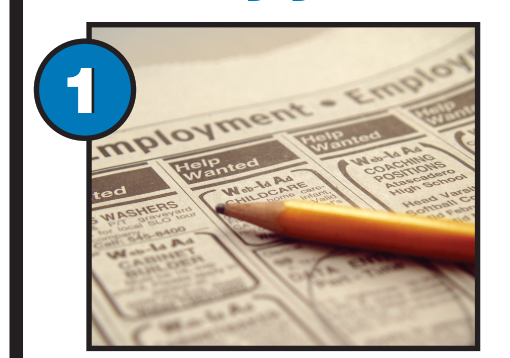
Find an open position