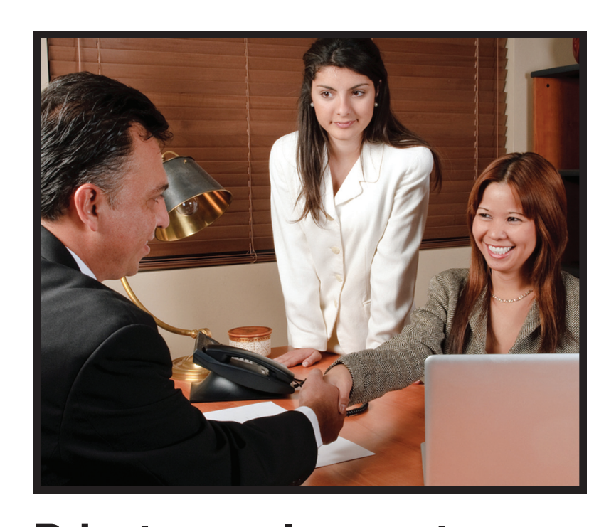
Private employment agencies