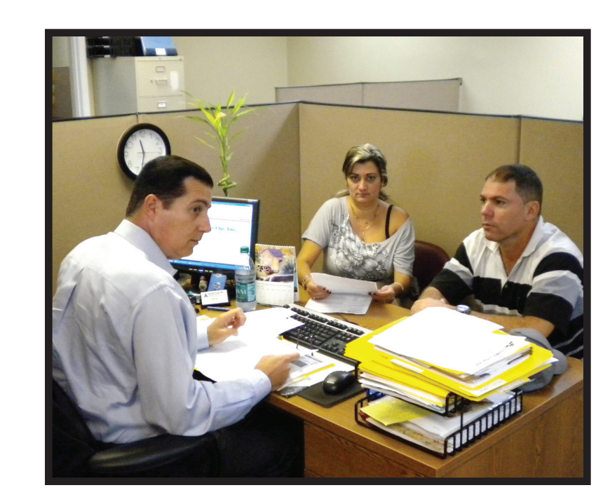
Your local resettlement agency and refugee employment services