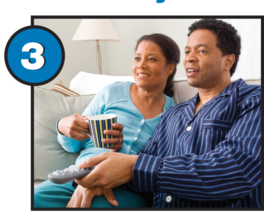
Wait for contact or follow up with the employer