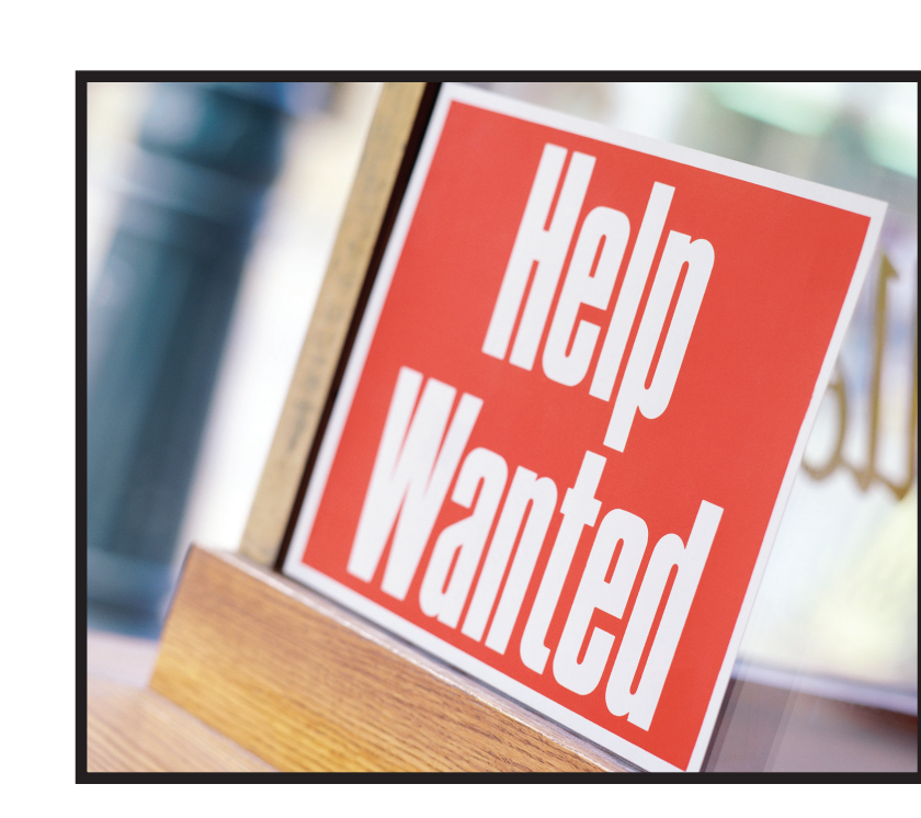
Help wanted signs