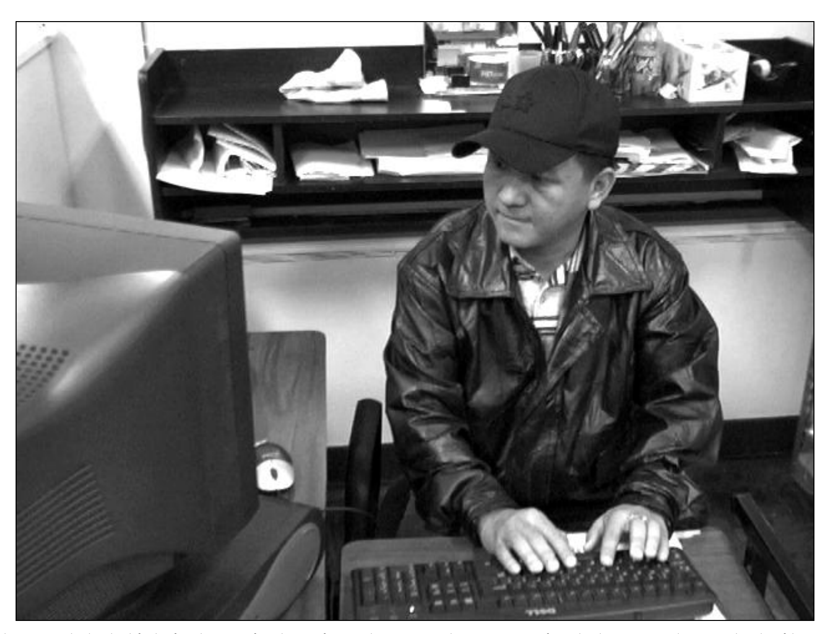
This document was developed with funding from the Bureau of Population, Refugees, and Migration, United States Department of State, but does not necessarily represent the policy of that agency and the reader should not assume endorsement by the federal government.