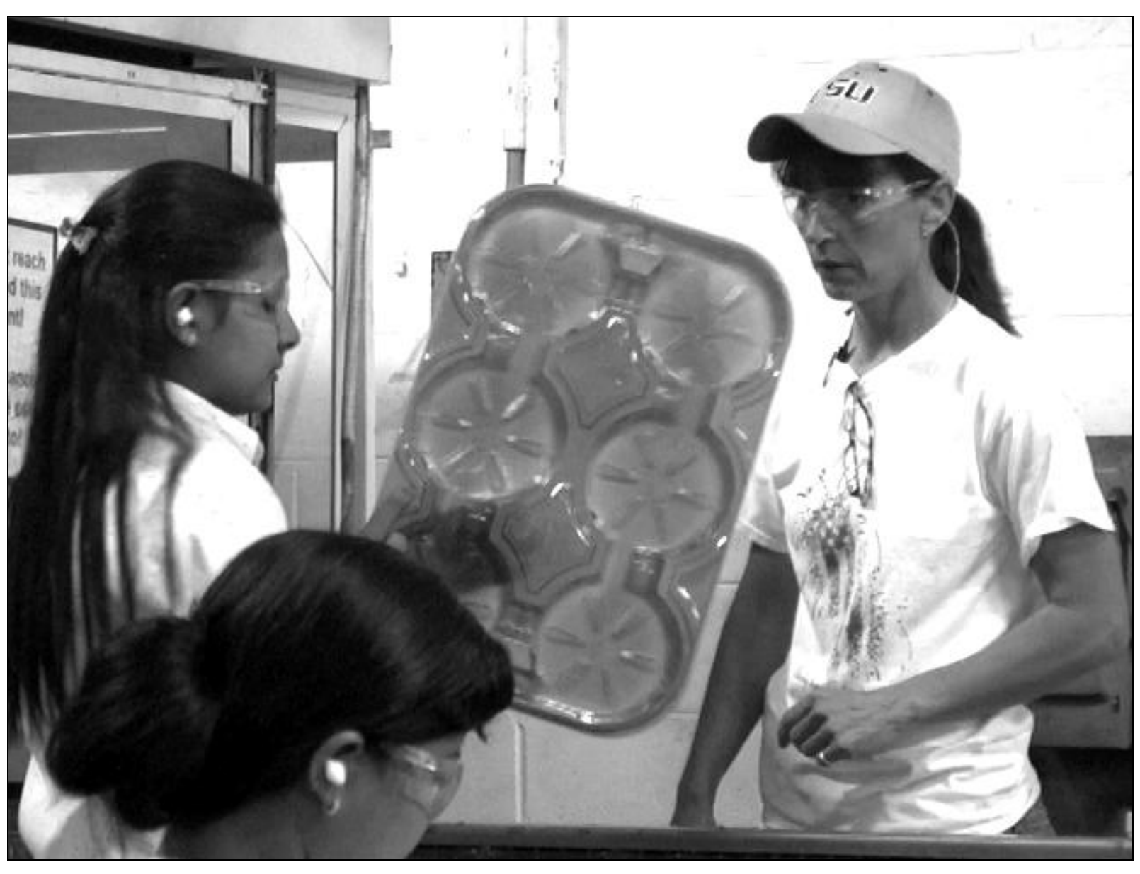
This document was developed with funding from the Bureau of Population, Refugees, and Migration, United States Department of State, but does not necessarily represent the policy of that agency and the reader should not assume endorsement by the federal government.