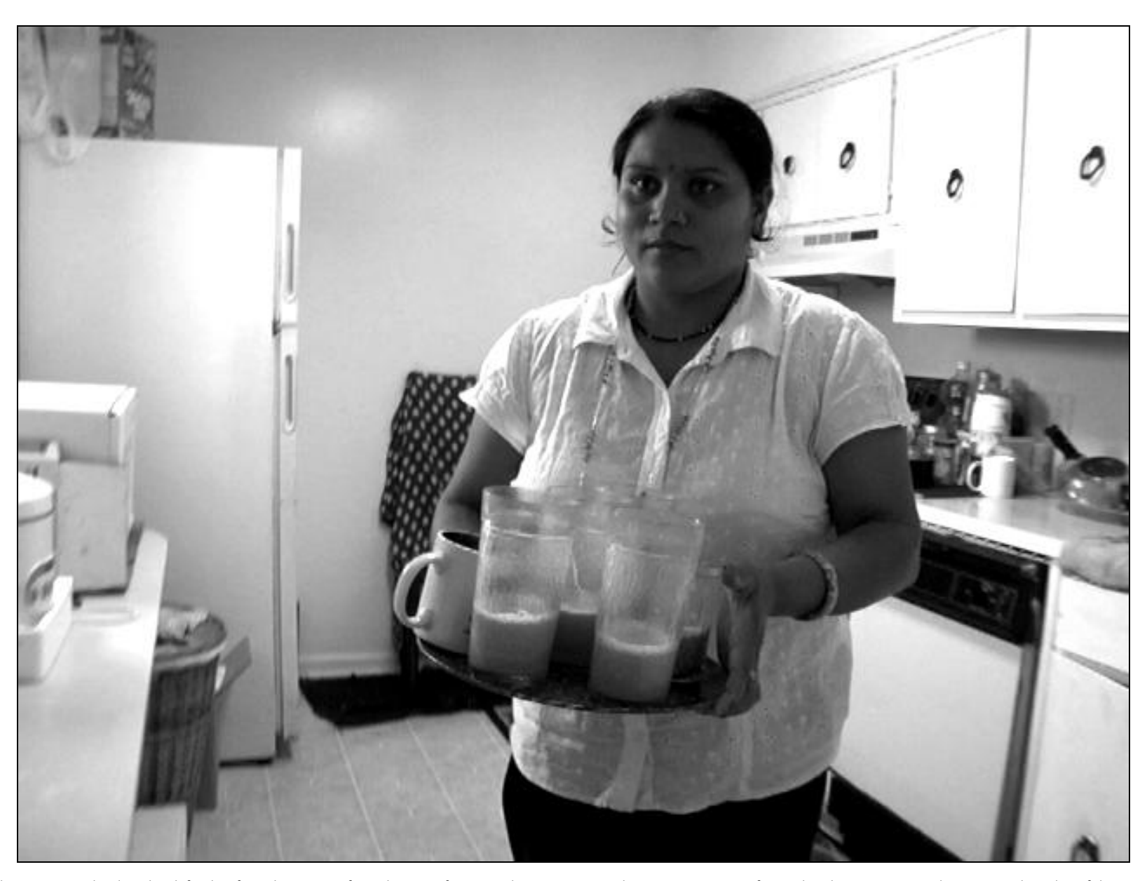
This document was developed with funding from the Bureau of Population, Refugees, and Migration, United States Department of State, but does not necessarily represent the policy of that agency and the reader should not assume endorsement by the federal government.