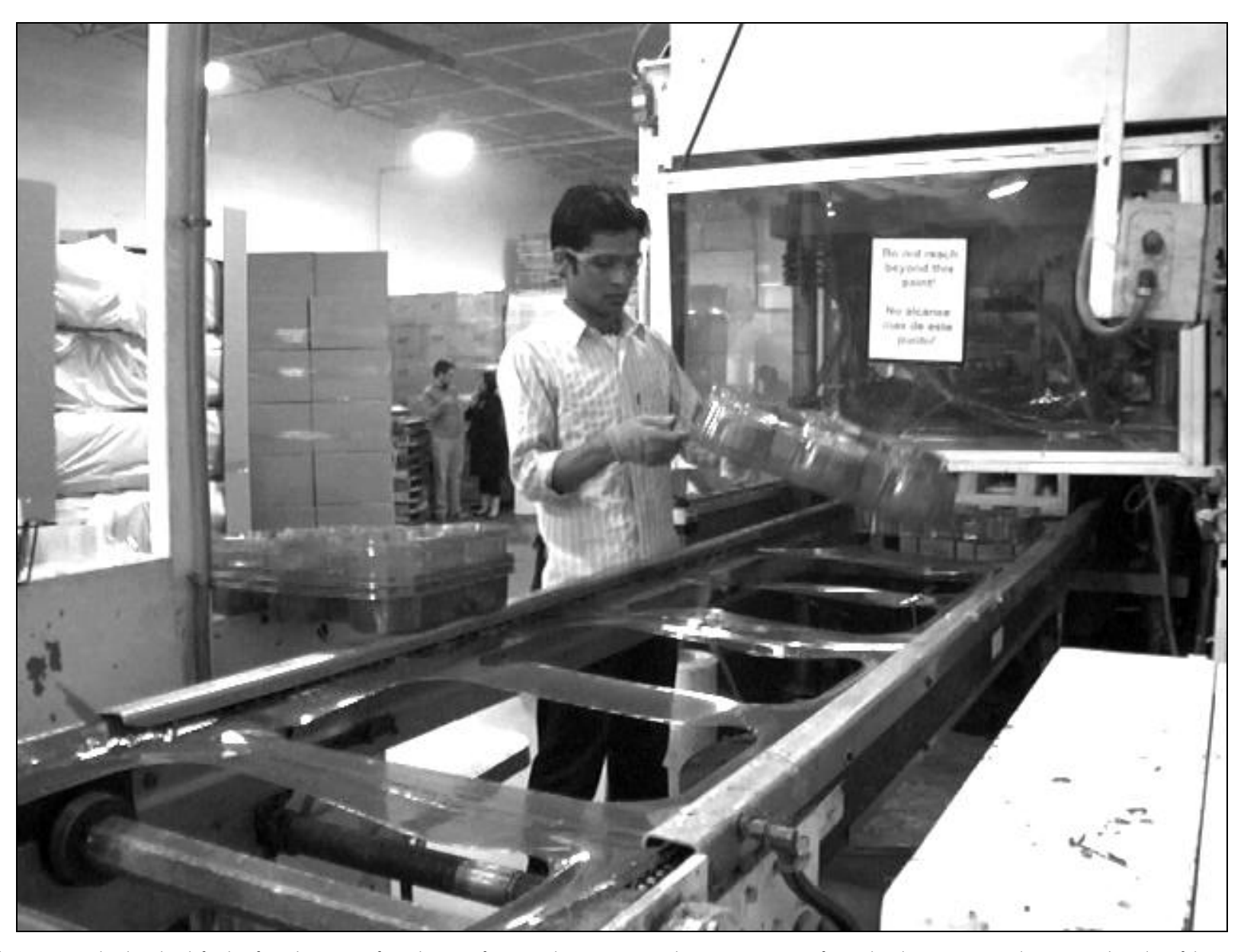
This document was developed with funding from the Bureau of Population, Refugees, and Migration, United States Department of State, but does not necessarily represent the policy of that agency and the reader should not assume endorsement by the federal government.