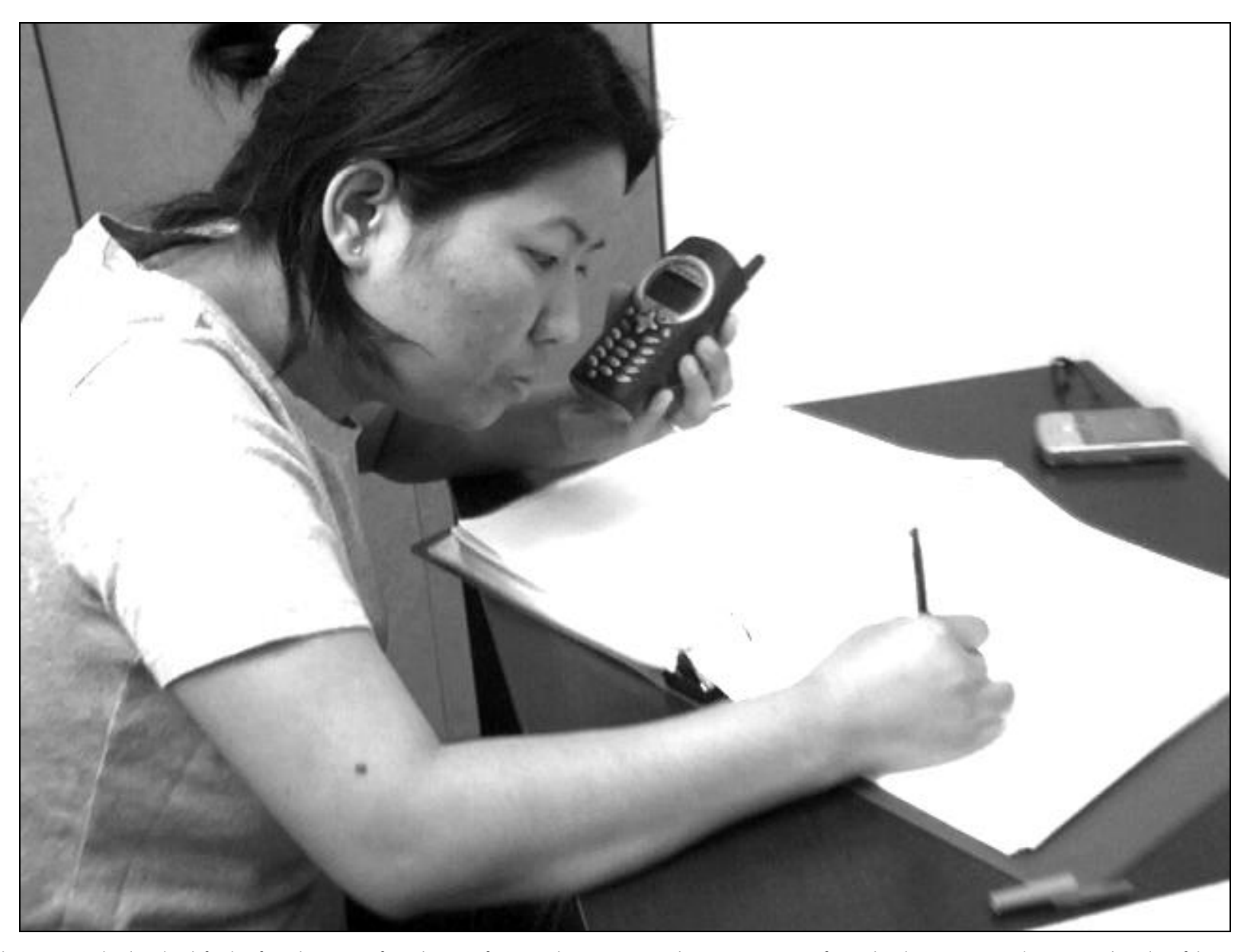
This document was developed with funding from the Bureau of Population, Refugees, and Migration, United States Department of State, but does not necessarily represent the policy of that agency and the reader should not assume endorsement by the federal government.