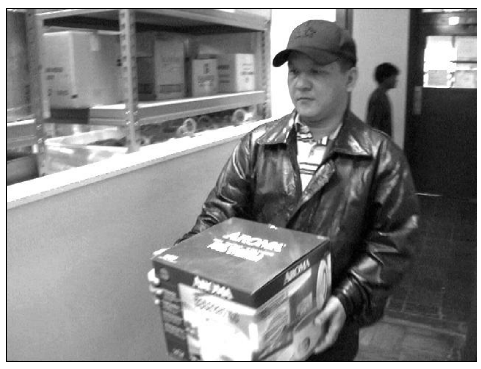
This document was developed with funding from the Bureau of Population, Refugees, and Migration, United States Department of State, but does not necessarily represent the policy of that agency and the reader should not assume endorsement by the federal government.