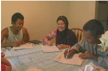
Speaking English at home