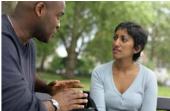
Practicing English with friends or neighbors