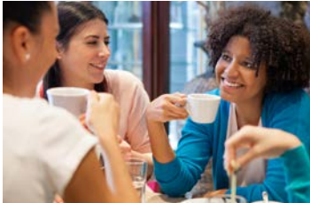
Doing activities you enjoy with English speakers