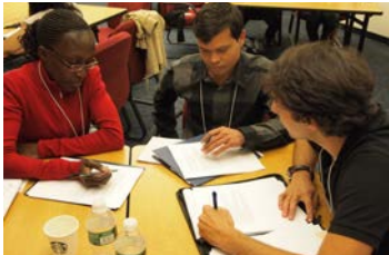
Joining (or creating) a group to practice English