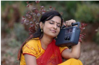
Listening to the radio