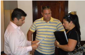
Listening to your case worker/manager or teacher