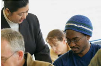
Attending English language classes

Directions: Circle three ways you will try to learn English.