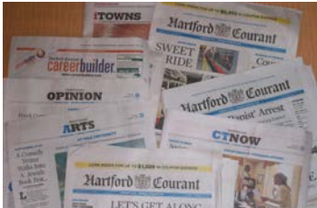
Reading local newspapers