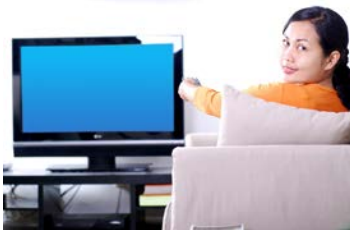
Watching movies or television