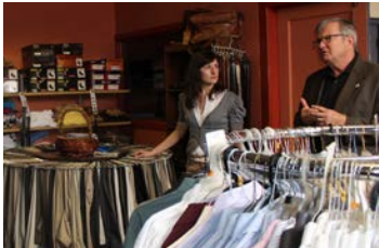
Speaking English at work