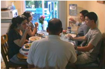
Having "English only" time at home each day