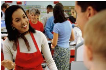
Talking with people in stores